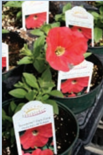
dark coral vein trailing petunia