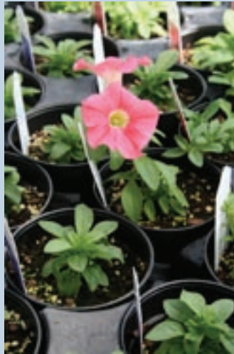
salmon vein trailing petunia

Savoie said Lanoha Nursery employees are always available to answer questions or suggest ideas.