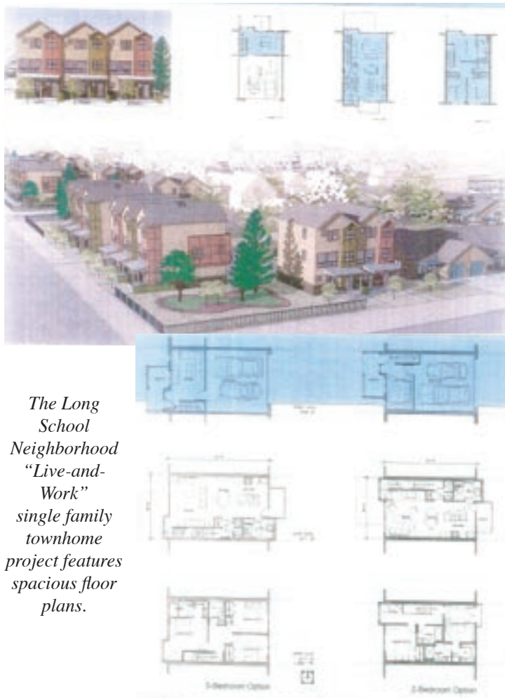
The Long School Neighborhood “Live-and-Work” single family townhome project features spacious floor plans.

The “Vancouver” model will be NCDC’s first single family home in South Omaha. The 1,378 square foot home will have three bedrooms and two baths and feature such amenities as a stove, refrigerator, microwave, dishwasher, garbage disposal and security system.