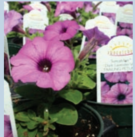
dark lavender vein trailing petunia